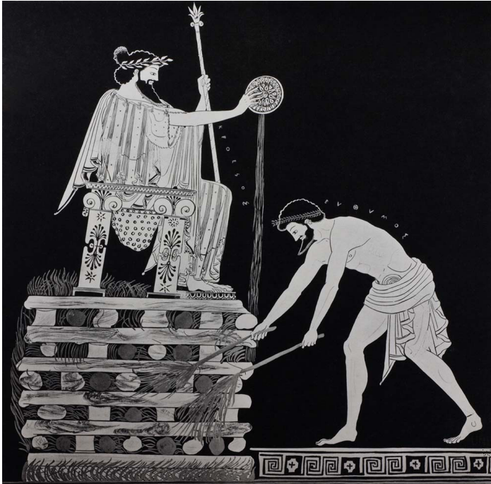
Amphora by Myson: Croesus on the funeral pyre, early 5th C. BC (Louvre G 197) (Furtwängler and Reichhold 1909 II, 277, Fig. 97, Pl. 113)